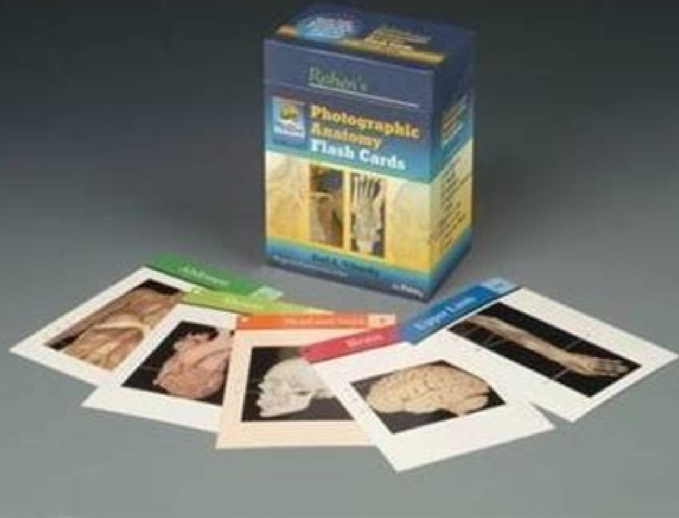
Rohen anatomy book. Rohen color atlas of anatomy. Rohen anatomy pdf. Rohen anatomy textbook. Rohen's photographic anatomy flash cards. Rohen colour atlas of anatomy. Rohen anatomy flash cards.

Wolters Kluwer | Lippincott Williams & Wilkins thePoint